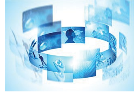
GRAPHIC | COURTESY OF VISTAGE INT'L 667

AI's biggest strength is its ability to automate repetitive, time-consuming tasks — freeing up employees to focus on high-value work. How to identify automation opportunities: